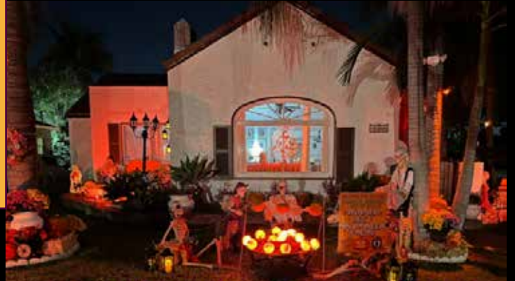
BEST HALLOWEEN THEME The Escalera Family 1101 W. Washington