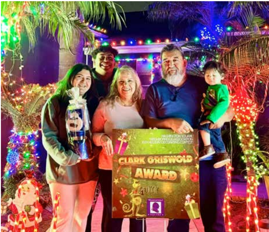
CLARK GRISWOLD 1311 Lowell The Estrada Family