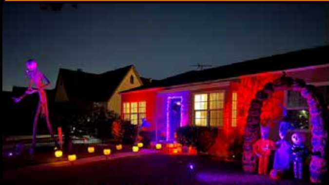
BEST USE OF LIGHTS The Fausto Family 1105 N. Olive