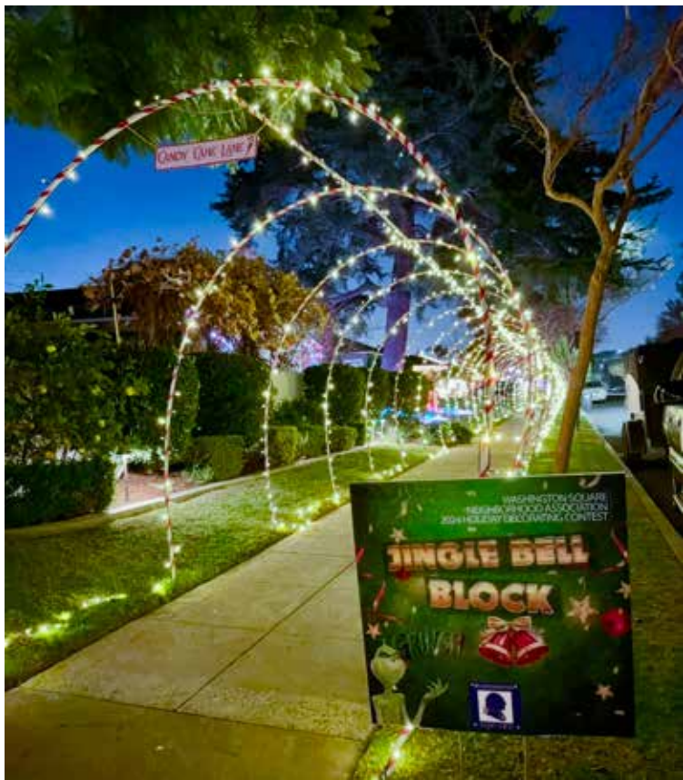
JINGLE BELL BLOCK Towner Street